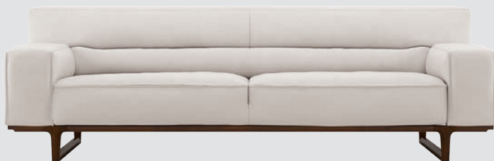
Three-seater sofa H77 - W242 - D104 cm H 30 - W95 - D41"