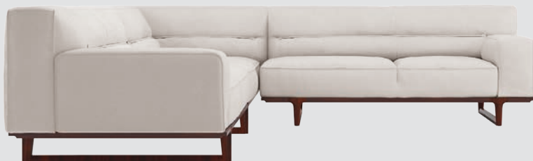
Sectional H77 - W278 - D327 cm H30 - W109 - D129"