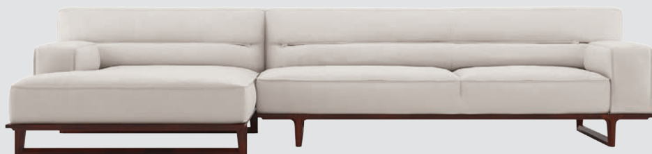
Chaise sofa H77 - W342 - D168 cm H30 - W165 - D66"