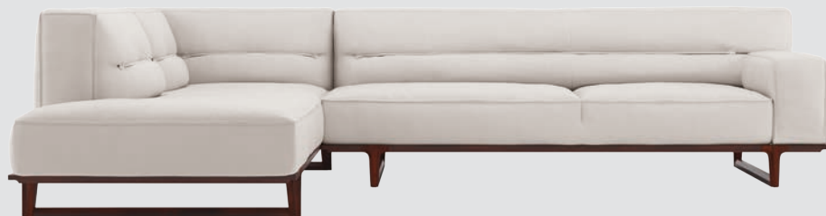
Sectional with end unit H77 - W322 - D242 cm H30 - W127 - D95"